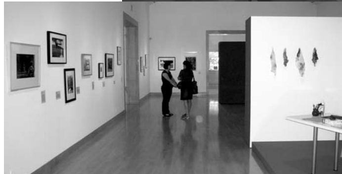
Above and left: Visitors taking in the art in LAPS's Contemporary Ruin at the California Center for the Arts in Escondido, CA.

PRINTMAKING EVENTS HELD AT CRAFT AND FOLK ART MUSEUM, LOS ANGELES, CA Thursdays, November 6 & 13, 2008